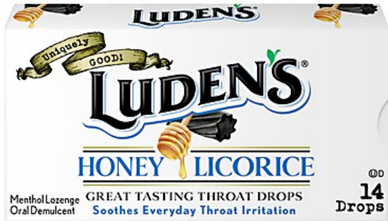
exhibit 1 of 908 >

VIEW YOUR SUBSCRIPTION STATUS FIND JOBS/TALENT ENTER A COMPETITION ADVERTISE WITH US