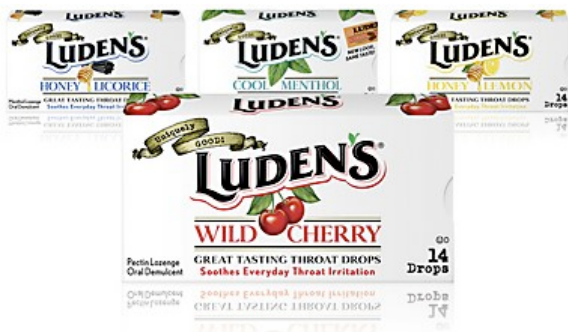
exhibit 1 of 908 >

SHARE THIS StumbleUpon Facebook Twitter LinkedIn Del.icio.us